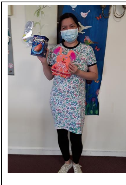
Below - The winners of the 'decorate an Easter bunny' Competition.